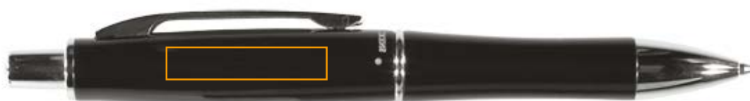
2. NEAR CLIP LEFT HANDED