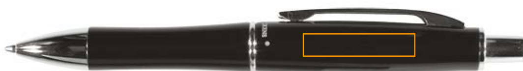
1. NEAR CLIP RIGHT HANDED