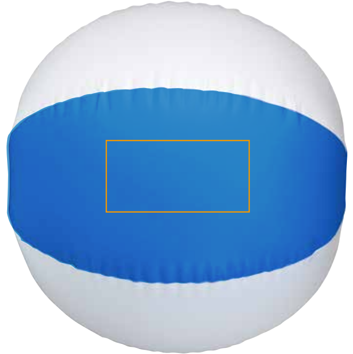
2. PANEL 1