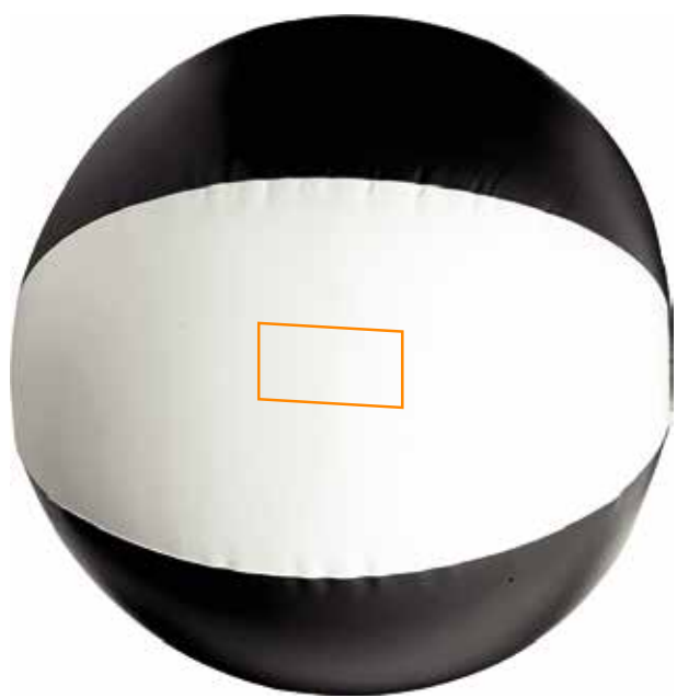
4. PANEL 1