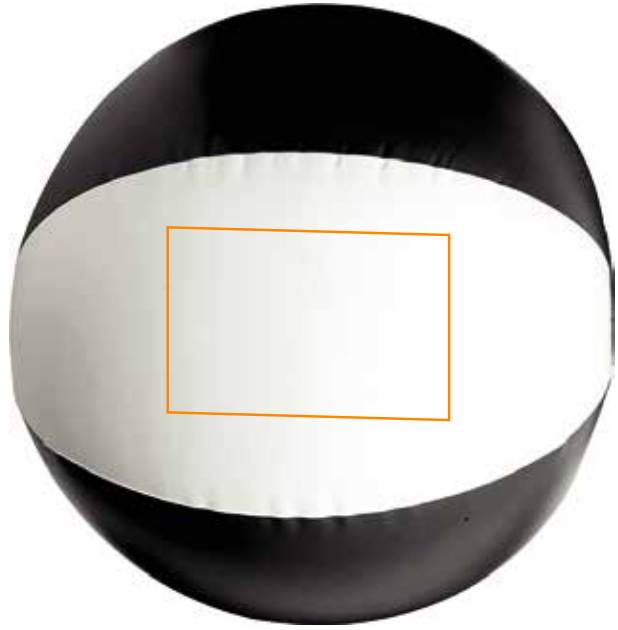
2. PANEL 1